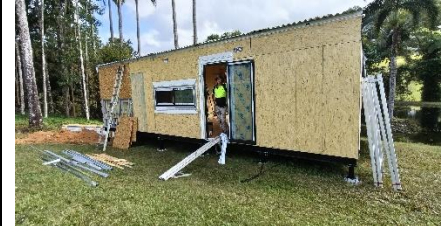
Channel News Asia post Covid on resilient business in Hulu Langat Selangor